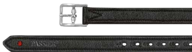
Shiny highlight: stirrup leathers with Premium Crystals in Siam Red (Picture: jpg)