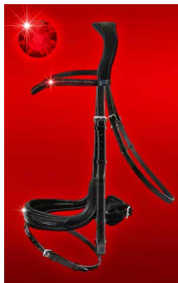
Dream-bridle: The Starlight Snaffle Bridle with patent leather noseband and browband with sparkling Premium Crystals in Siam Red (Picture: jpg)