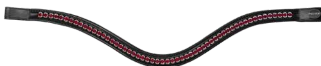
Sparkling eye-catcher: the browband with sparkling Premium Crystals Side by Side in Siam Red (Picture: jpg)