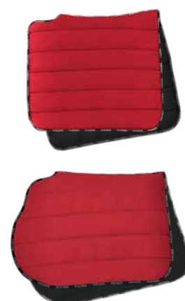
Wonderful and versatile: the FlexiPads® in two-tone Siam Red/Black. (Picture: jpg)